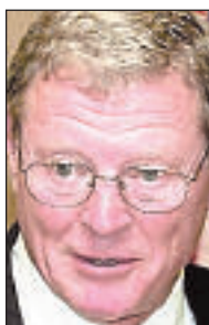
Inhofe Oklahoma Sens. Inhofe and Coburn voted against the resolution.

Democrats swiftly claimed victory. "A majority of the United States Senate is against the escalation in Iraq," said Majority Leader Harry Reid of Nevada. "As for the Republicans who chose once again to block further debate and protect President Bush, the American people now know they support the escalation" in troops.